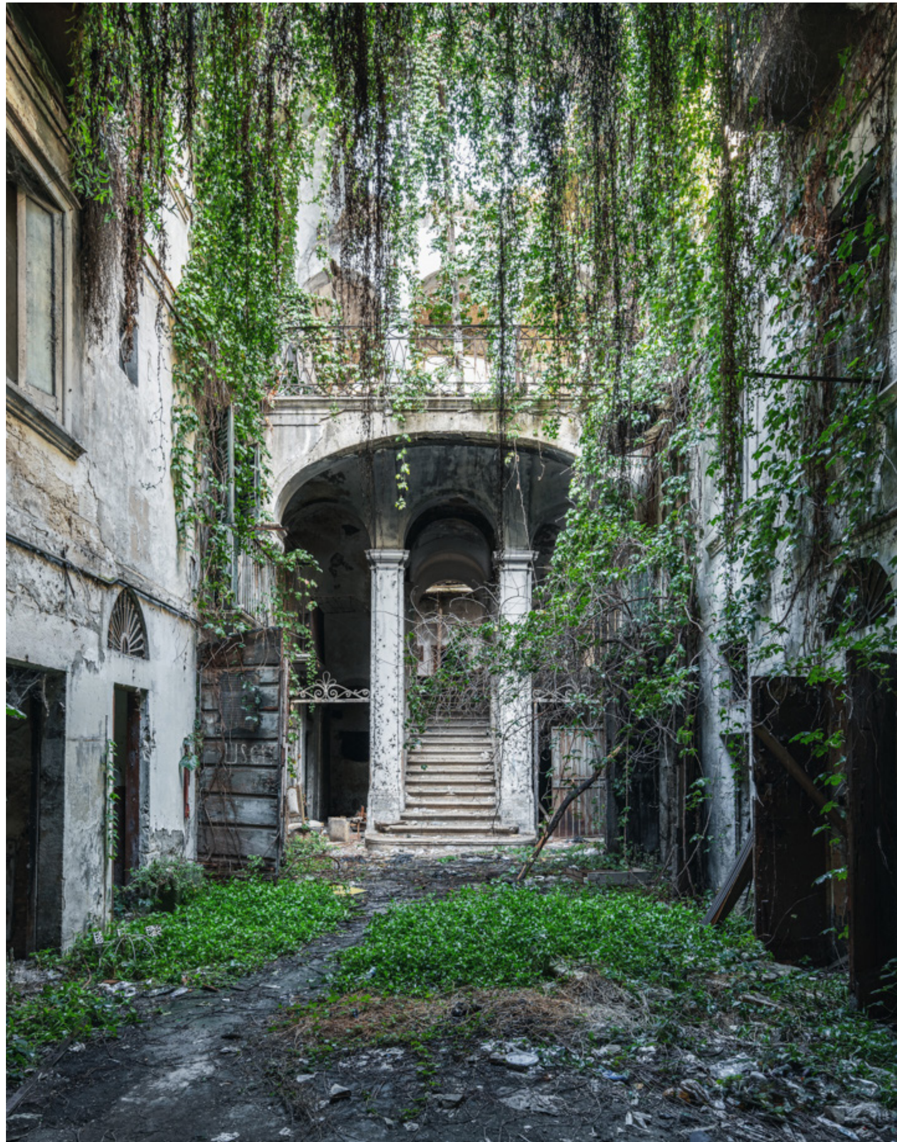
Dopo la caduta

- cm. 96 x 120 - photo fine art on dibond