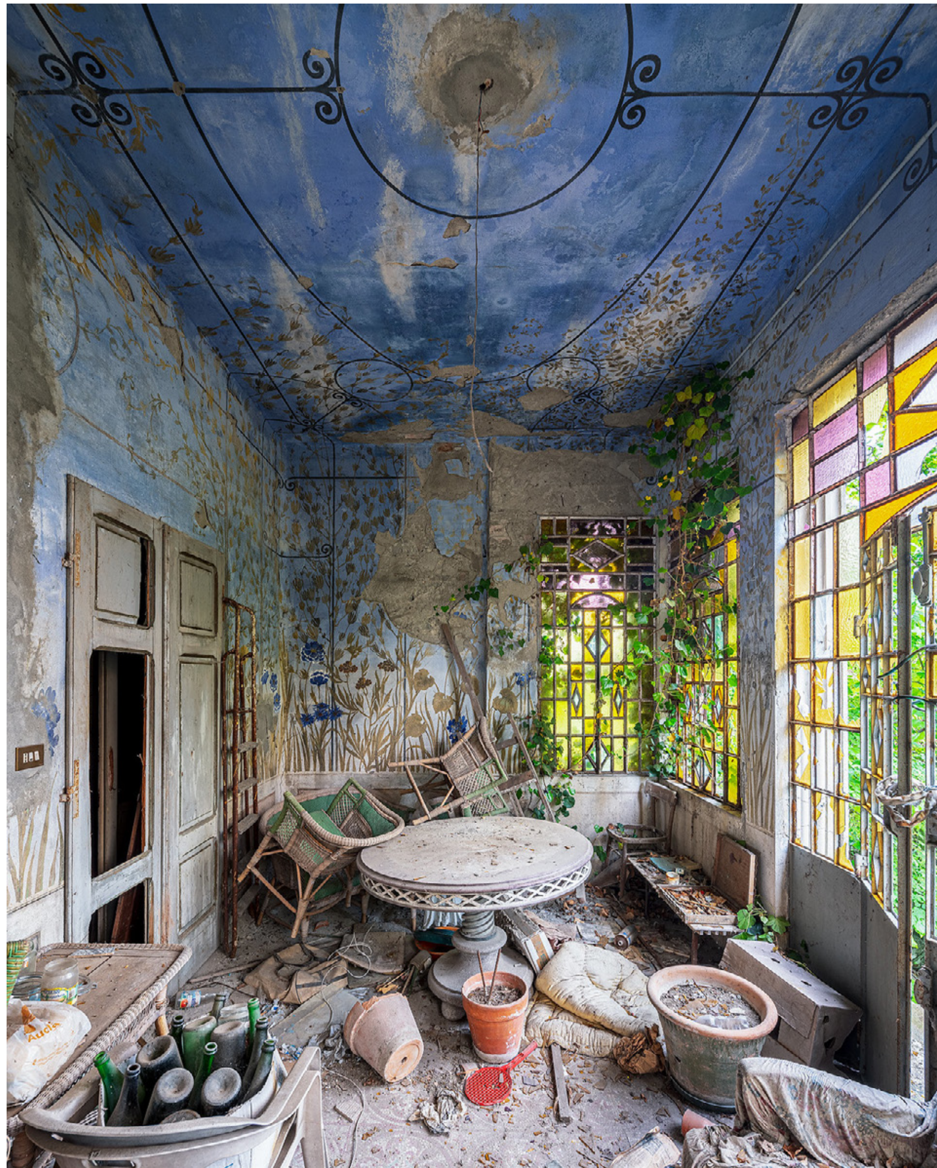
Il peso di molti inverni

- cm. 96 x 120 - photo fine art on dibond