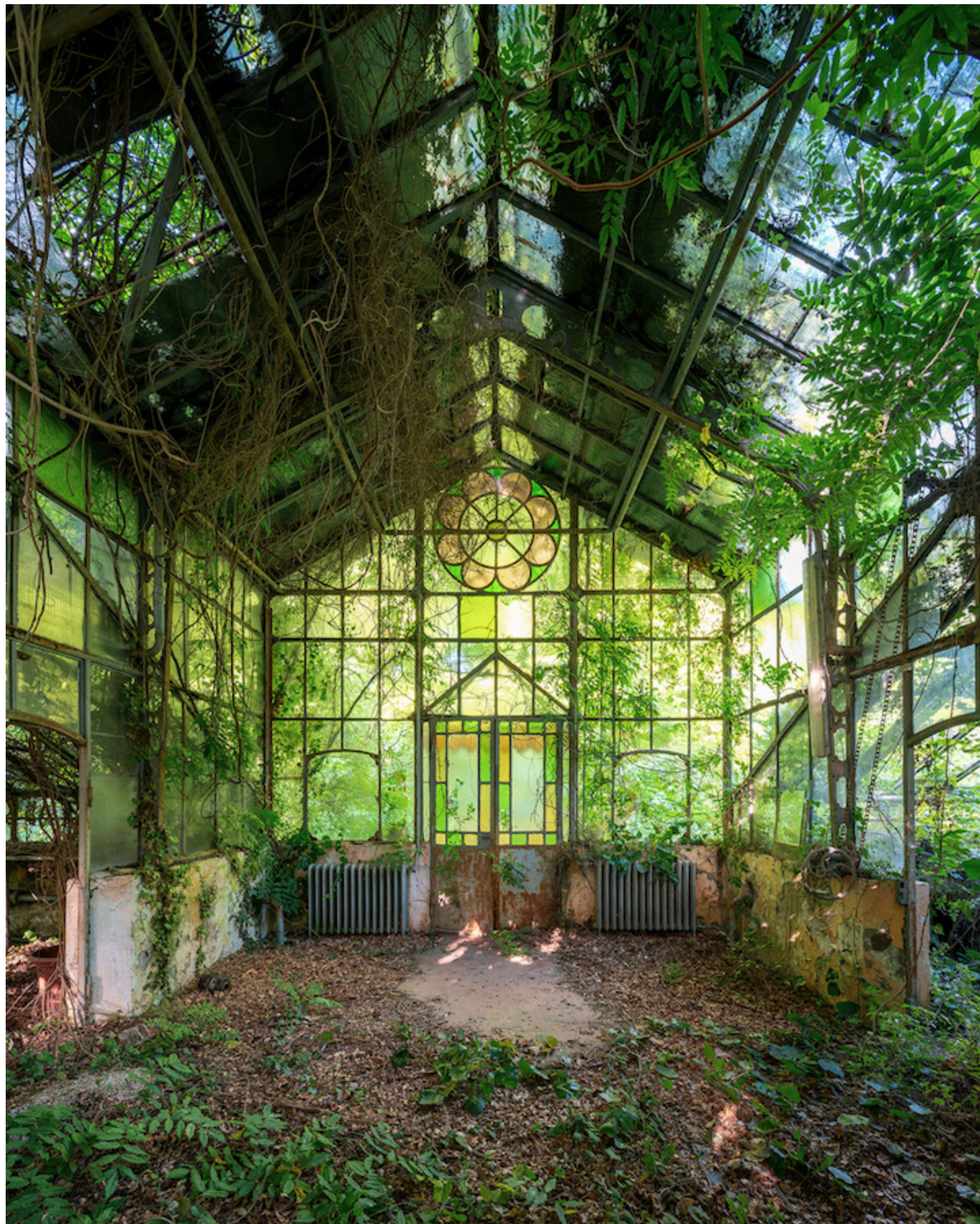
Il terzo paesaggio

- cm. 96 x 120 - photo fine art on dibond