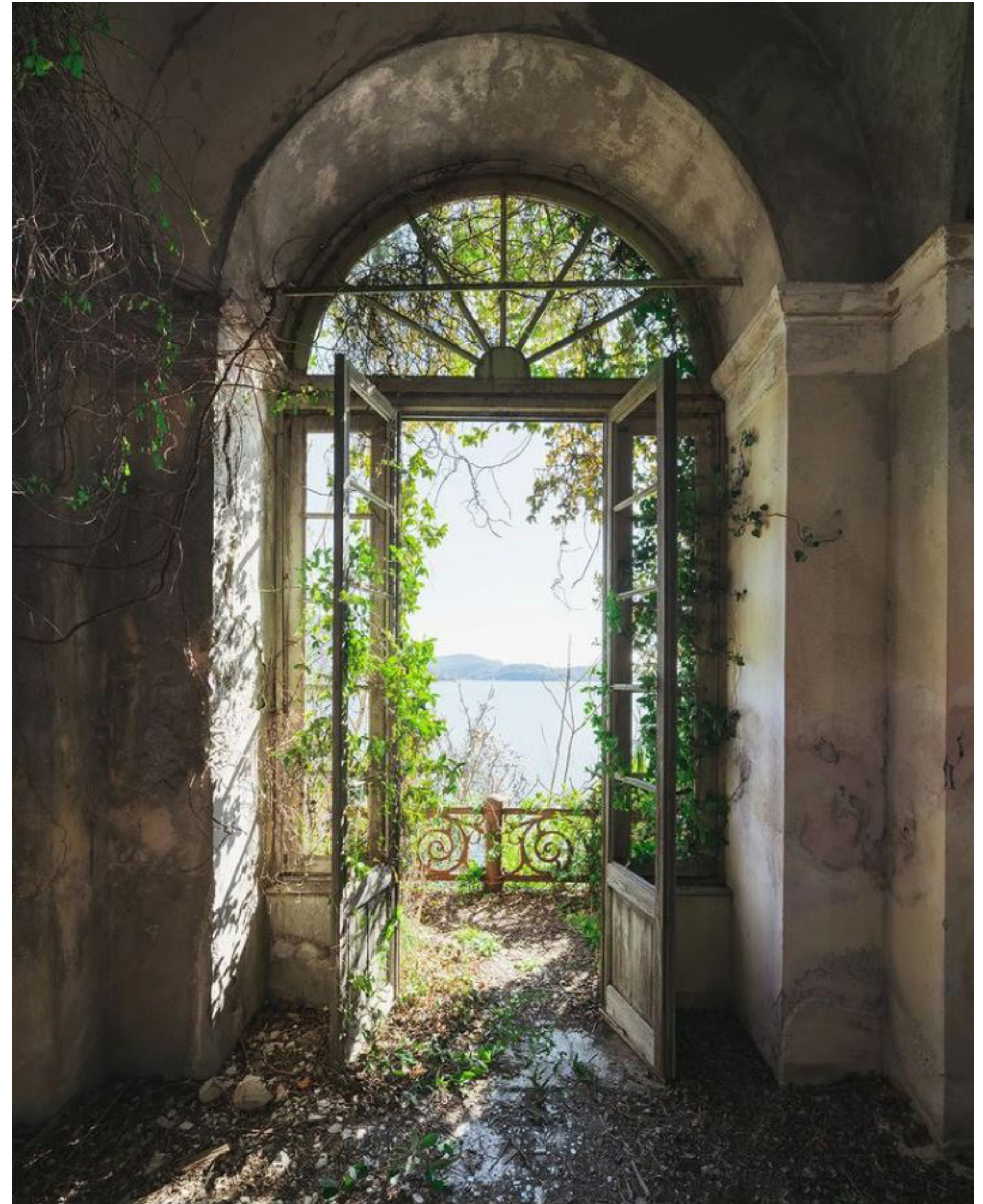
Alla fine del sogno

- cm. 136 x 170 - photo fine art on dibond